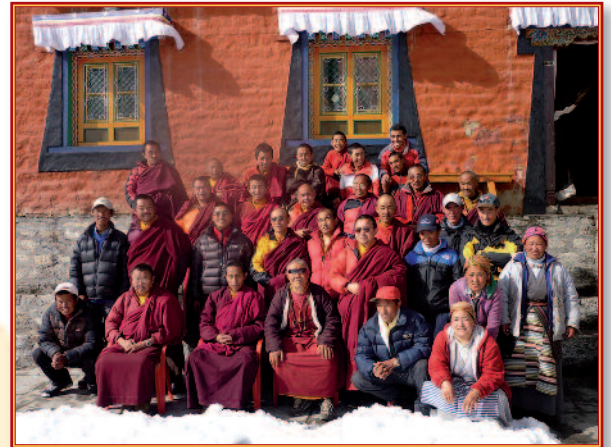
Thame monks with local supporters

Since January 1st 2010 the monks get hot meals every day. Breakfast at 7.30 in the morning, lunch at 12 o'clock, a tea break at 3 p.m. and dinner at 7 p.m.